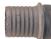
1" - 2-1/2" male