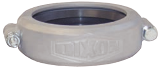
clamp with black nitrile rubber gasket

Note: Supplied clamp gasket must be installed prior to use, ships separately.